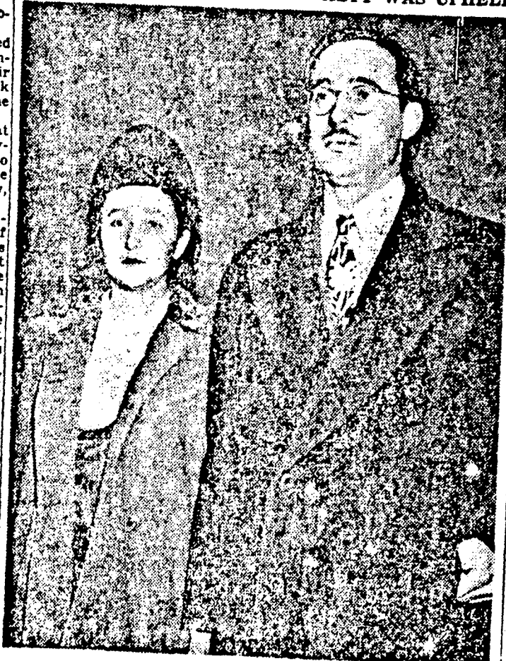
Julius Rosenberg and his wife, Ethel, whose sentences for espionage were unanimously affirmed yesterday by the United States Court of Appeals. They are shown here on their arrival at the Federal Courthouse last year.